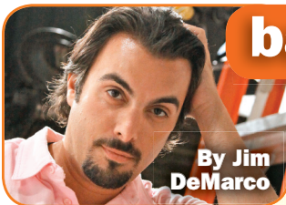
By Jim DeMarco

The Daytime Emmys always serve up a smorgasbord of looks, and this year's leading ladies did not disappoint when it came to beauty. Hair and makeup styles revealed polished and well-balanced canvases and manes. Everyone came red carpet ready with powerful pouts and come-hither eyes.